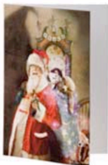
Ho Ho Ho